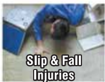
Slip & Fall Injuries

Our daughter had a very serious brain injury. We contacted eleven personal injury law firms, none of which were willing to help us. We then contacted the firm of Bergel Magence LLP. We could not have had a more involved team looking after our daughter and her case. Their tenacity, strategy and actual caring for our daughter led to a settlement of more than $1,150,000 and her lawyer is still in contact with us nearly five years later. We highly recommend Bergel, Magence LLP.