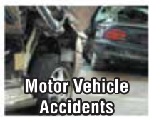
Motor Vehicle Accidents

My nephew was involved in a serious car accident which left him in a coma for a number of months. Bergel, Magence LLP was always there to answer questions, meet with the doctors and therapists to ensure my nephew was getting the best care. Bergel, Magence settled the case for more than $2 million . I was so pleased with the care and attention we received, I have recommended their services to other accident victims. Thank you for the expertise, guidance, dedication and professionalism that the staff portrayed throughout this time.